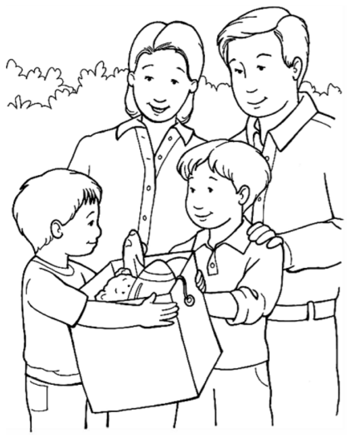
"I can show my friends that Jesus loves them."