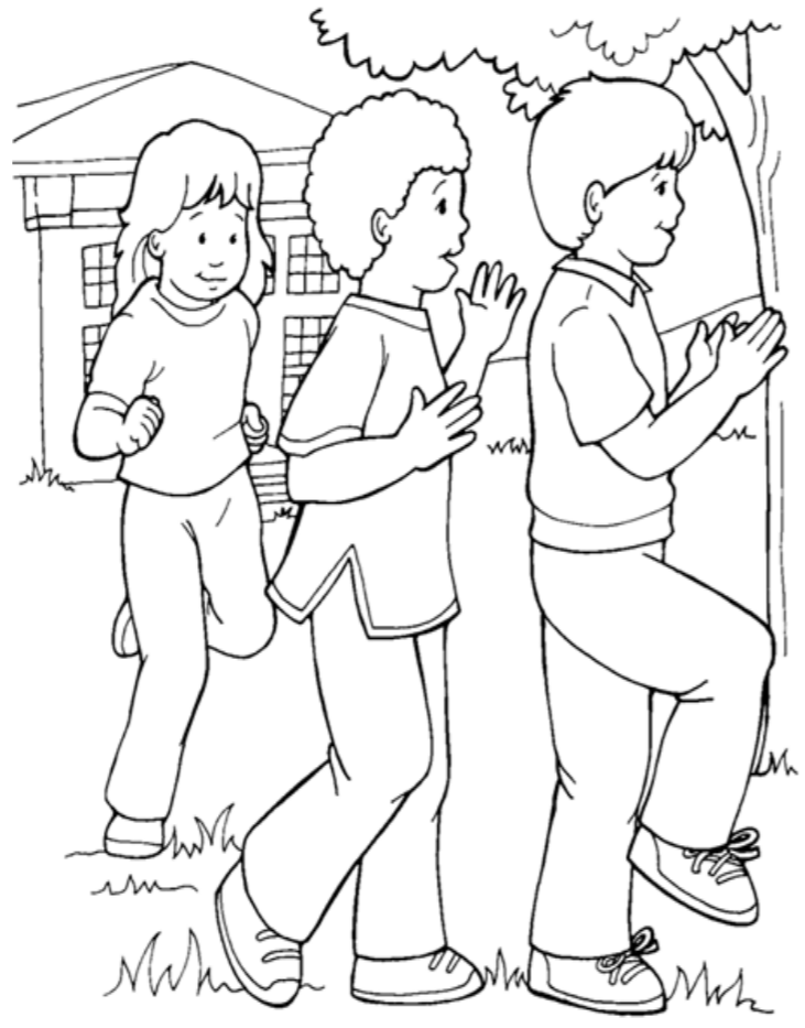
I will follow Jesus, our leader.

X M V Q X O V J W J O U Z E X Q Z P E P F Y A B W M P R X W E F V A L F O R F E I T O I J T A F E C F I N N B I W L M U S R S U E L F Q M Z D L M W V Q I P E C X G S I V D S T R P P R V Q U R C F L M L U P E F R I Y F Y E O H S T D O L L L G E Q N O Z V S A F A O S L Z L I E Y N L A N S N H W G E K O D H O Q F L V R W G L A S V F G F H L K T O L I F E I O V I W O R L D O D W T U I N U C N I Y O O S U Q C G B Q Y L L D H T P D T V E P J M U H Z Y