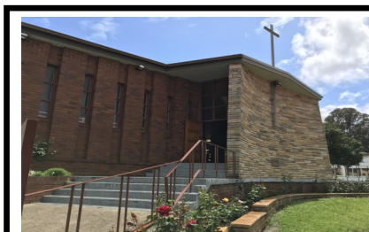
our parish! Visit www.olol7hills.org.au

Church Cleaning Rosters for 2020 are available on the table near the back sacristy.