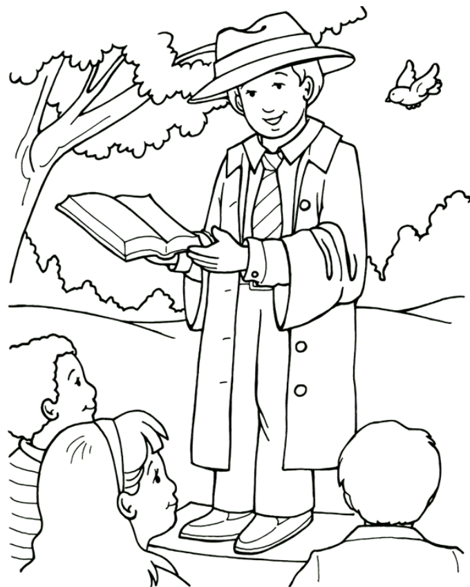
Inviting others to Jesus