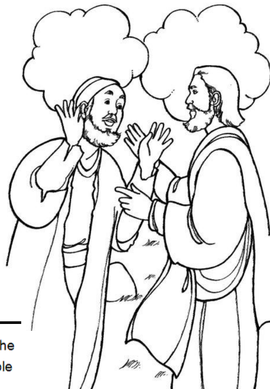
Jesus helps this man speak and hear